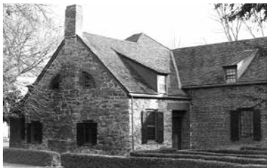
#34 Senate House State Historic Site