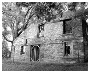
#41 Frog Alley Ruins