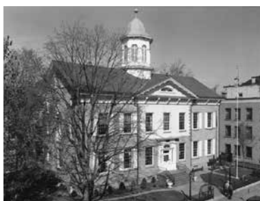
#3 Ulster County Courthouse