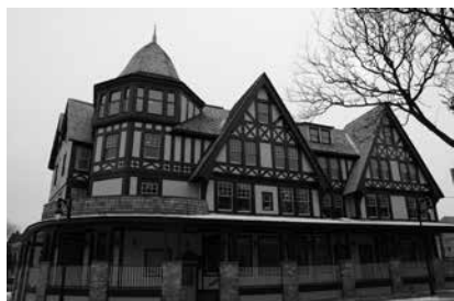
#30 The Kirkland Building