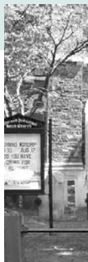
#2 Old Dutch Church