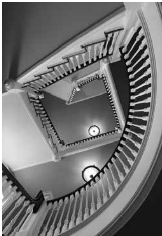
An interior staircase of the Kirkland Hotel Building

The 75-room Tudor style building opened as a boarding house in 1899 but became a hotel in 1922. From 1952-1972 its basement was the home of the popular Dutch Rathskeller. Hotel accommodations ended in 1968. Empty for more than 30 years, the building was threatened with demolition until it was restored by the nonprofit RUPCO. Reopened in 2005, it offers a mix of commercial and residential spaces.